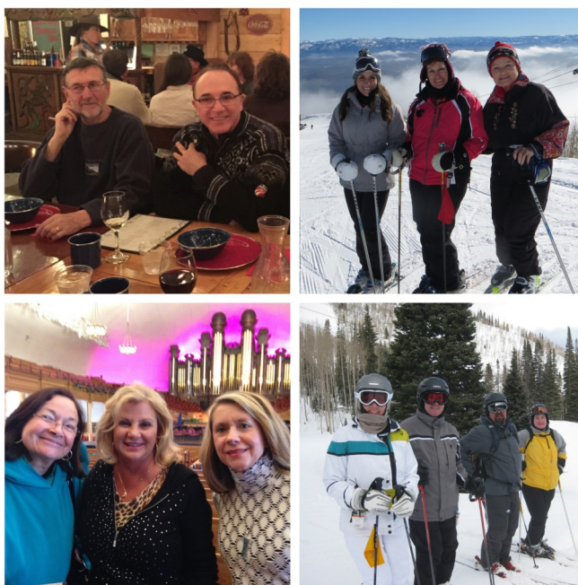
Our last trip to the Park City area in 2015!