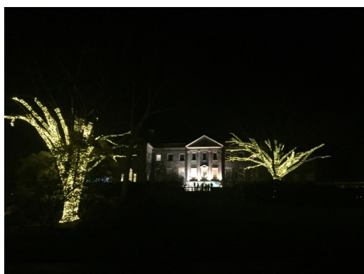
Left: Cheek- wood